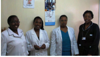
The Palliative Care Team at Kijabe Hospital

In the meantime, progress continues to be made with the construction of a new hospice building, which means that PC will become even more prominent. Work on the foundations started in late 2010. The building was originally planned as a one-storey constru-